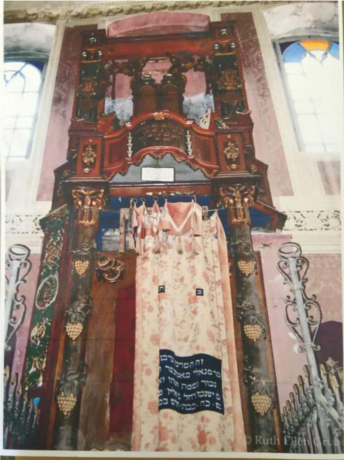
Aron Hakodesh (as it was in Siret)