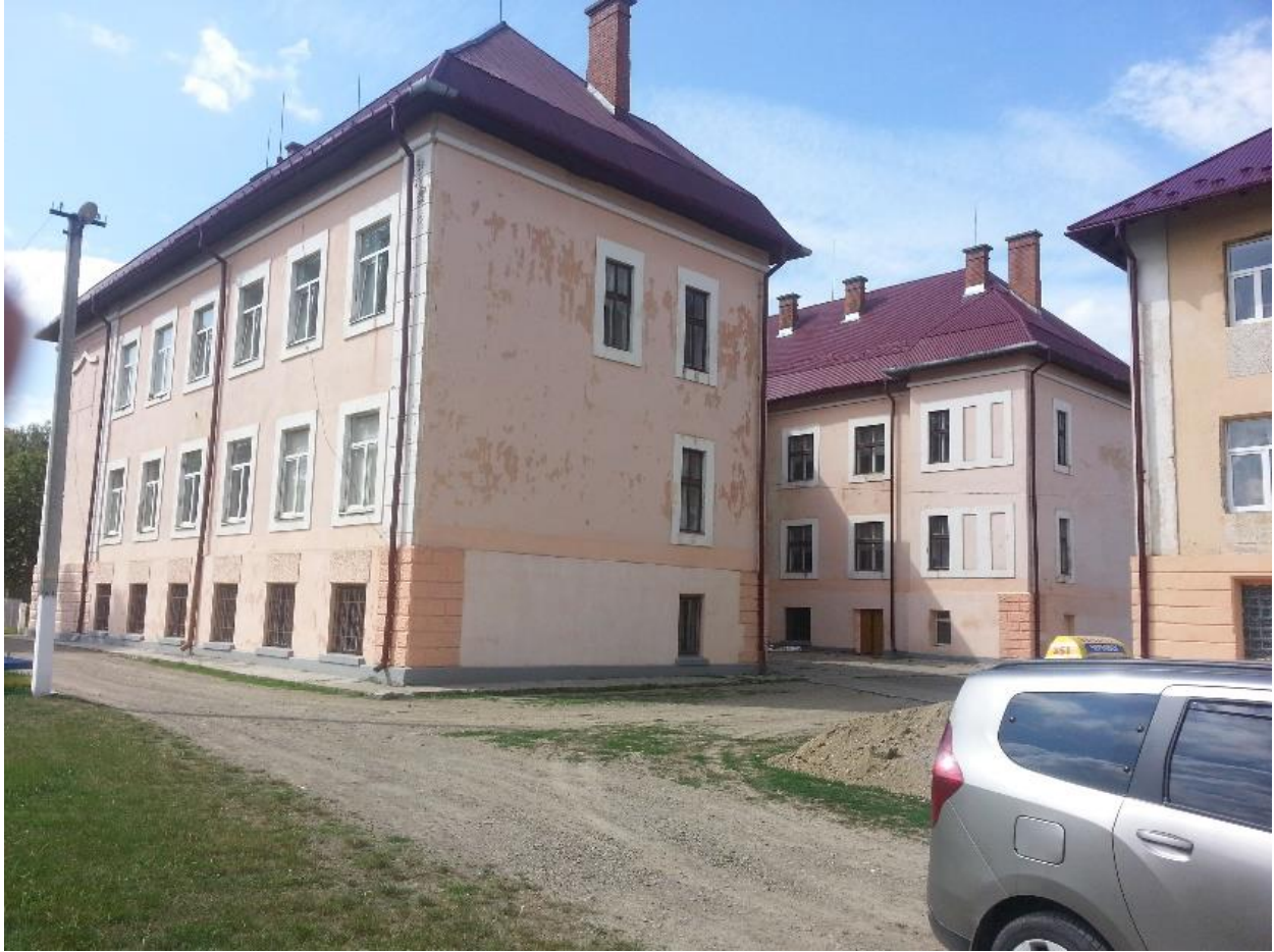
The "GERICHT" – Court house. The prison was in its basement.